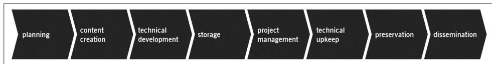
Fig. 1. The model of research project lifecycle by Nancy Maron and Sarah Pickle (2014)

The model by Maron and Pickle encompasses the research projects on the preparation of digital research references for humanities research, or the creation of special computer tools for the analysis of this kind of research references. For instance, the projects could consist of creating digital collections, databases, content mapping tools, or data visualization tools. This model was elaborated for research on the organization of digital humanities at universities in the United States.